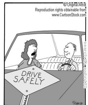
"That woke me up, too!"