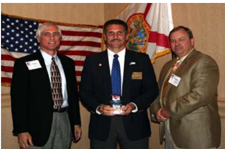
2006 Awards Banquet