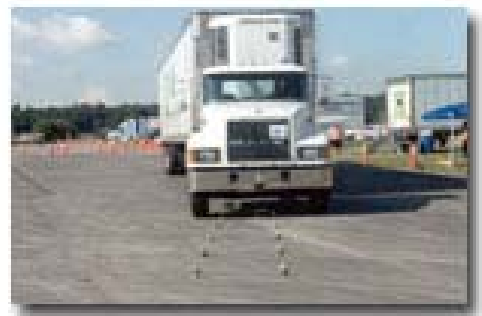
Truck Road Course

Visit our website @ www.nflasafety.com .